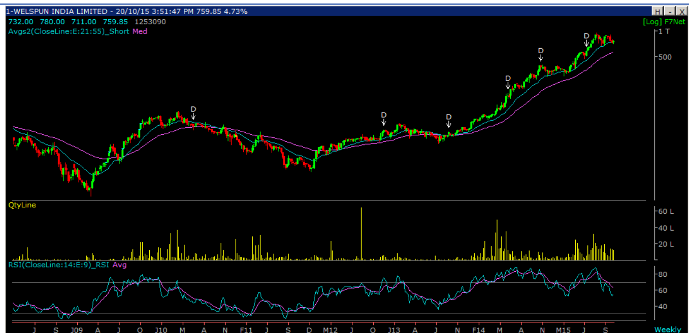
Exhibit 2: Technical Chart